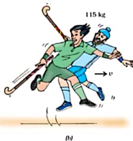
Fig. 9.19: A collision of two hockey players: (a) before collision and (b) after collision.

Let the first player be moving from left to right. By convention left to right is taken as the positive direction and thus right to left is the negative direction (Fig. 9.19). If symbols m and u represent the mass and initial velocity of the two players, respectively. Subscripts 1 and 2 in these physical quantities refer to the two hockey players. Thus,